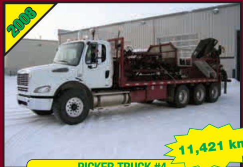
PICKER TRUCK #4