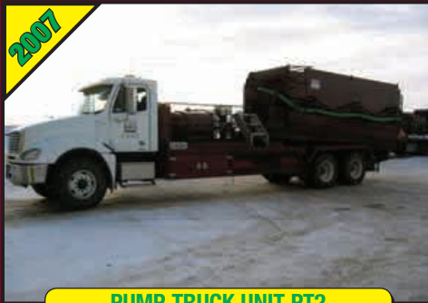
PUMP TRUCK UNIT PT2