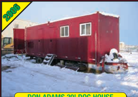
2006 DON ADAMS 30' DOG HOUSE