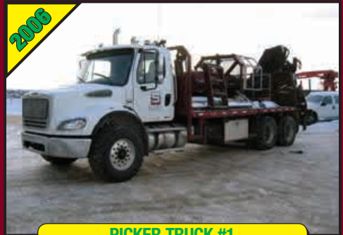
PICKER TRUCK #1