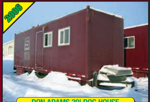
2006 DON ADAMS 30' DOG HOUSE