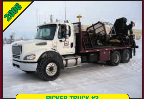
2006 PICKER TRUCK #3