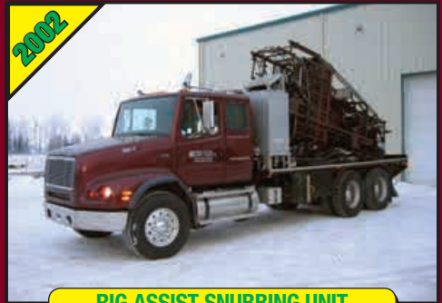
2002 RIG ASSIST SNUBBING UNIT