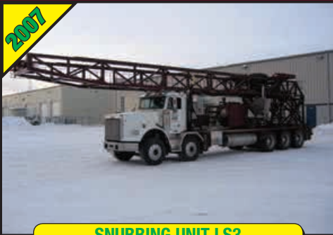
SNUBBING UNIT LS3