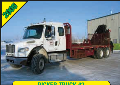
2005 PICKER TRUCK #2