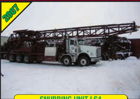
SNUBBING UNIT LS4

• LATE MODEL READY TO WORK EQUIPMENT IN NISKU (EDM.) AB •