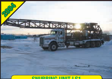
2004 SNUBBING UNIT LS1