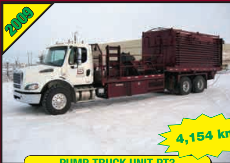
PUMP TRUCK UNIT PT3