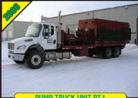
2006 PUMP TRUCK UNIT PT.1