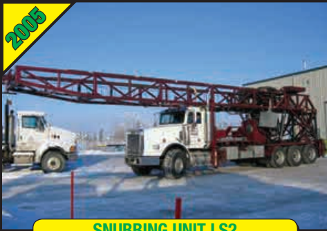
2005 SNUBBING UNIT LS2