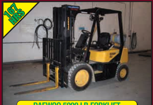
167 hrs DAEWOO 5000 LB FORKLIFT